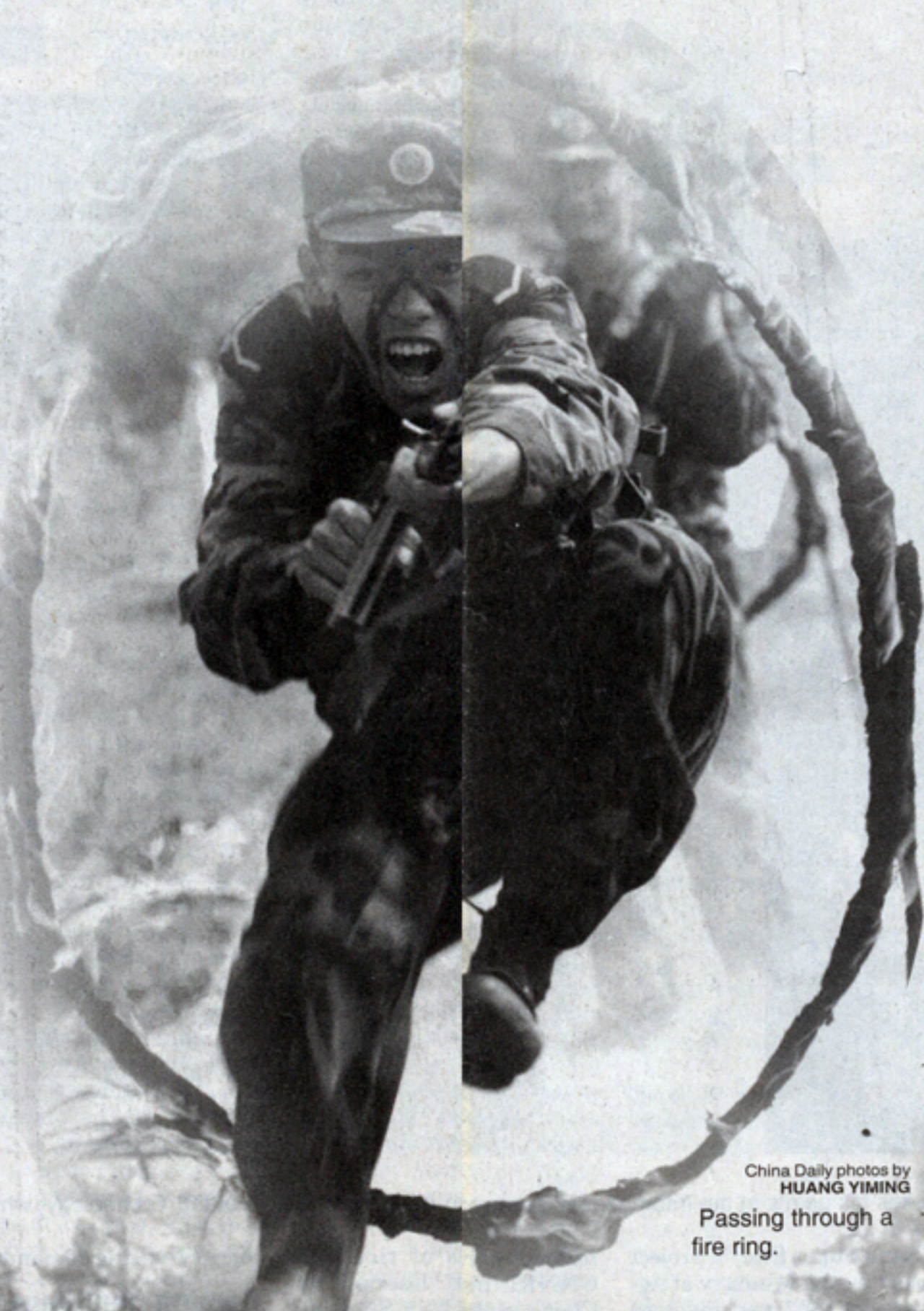
Passing through a fire ring.

China was invited to join the "Ernaretk" contest in 1998. Until this year, all four contests had Chinese army men in winning positions and they were highly praised by their rivals from European countries.